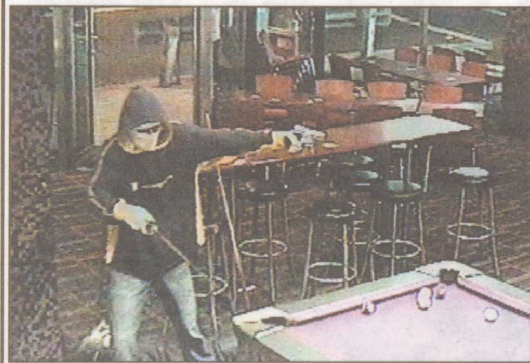
In focus: Video of an armed robber at St Leonards Tavern, Artarmon