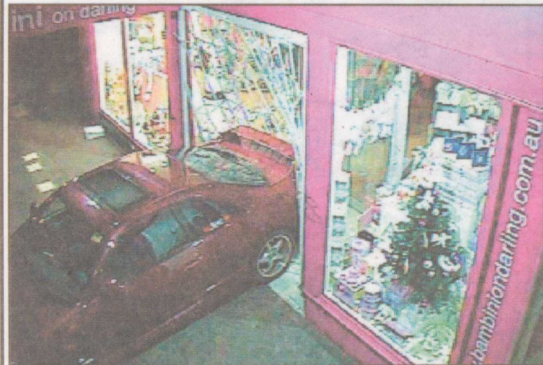
Caught on camera: Footage of a ram-raid at Bambini in Balmain